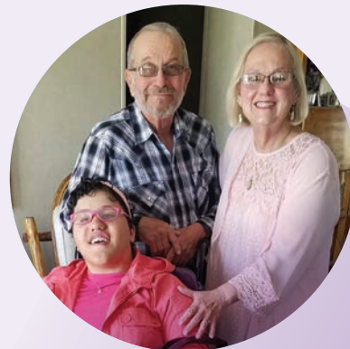
Families benefit from our caregiving programs.